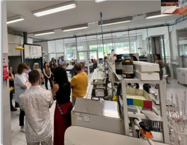
Partners during the visit to Citeve's facilities

The main topic of the discussions were focused on the conclusion of the last outputs, IO3, IO5 and IO6 .