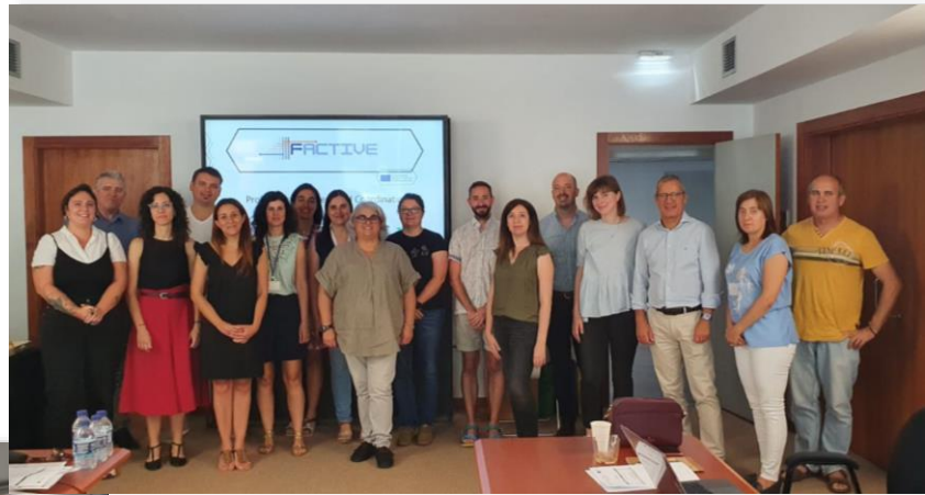
FACTIVE consortium on their Final Meeting

Last September 21 st , the consortium met for their Final Meeting in Portugal . Before the presentations and the specific contents discussions began, CITEVE , organised a visit on their facilities.